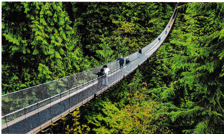
From top: The popular Granville Island Public Market features bars, gourmet food stalls and artisan boutiques. The Capilano Suspension Bridge is 450-feet long.

'Rockin' in the Free World' by Neil Young Like many of the world's great cities, Vancouver has a walkable, bustling downtown core, fully alive day and night. Sate your appetite and your historical curiosity with a tasty Gastronomic Gastown Tour . The neighborhood nicknamed for its earliest tavern keeper, "Gassy Jack" Deighton, was the site of the first European city here when it was known as Granville , population 1,000. Today, it is filled with historic sights and characterful pubs and eateries. Don't miss Kozak , a Ukrainian culinary success story. The owners immigrated in 2012, sold their baked goods at farmers' markets, ending up with this sleek modern restaurant. The holubtsi stuffed cabbage rolls and