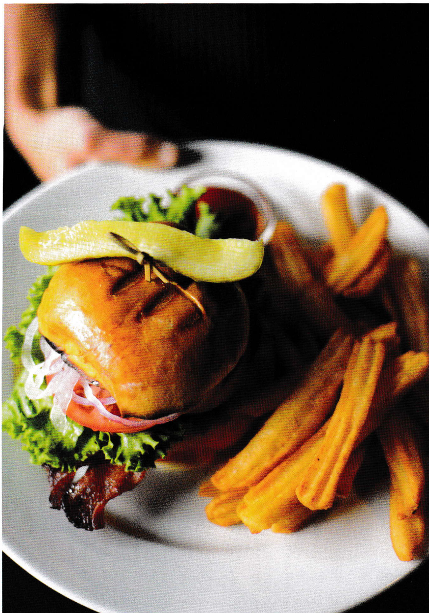
Grab a sirloin burger with bacon at the informal, waterfront Blackfin Pub in Comox.

Heading south to Victoria , small Cowichan Bay makes a pleasant stop for a night or two. The area was the first settled after Victoria, with Europeans arriving in the 1860s. The historic waterfront boasts an excellent restaurant built in 1868 — The Masthead — with charming back patio seating, lovely lunch spot True Grain , and a few small hotels led by Oceanfront Suites . There are some niche