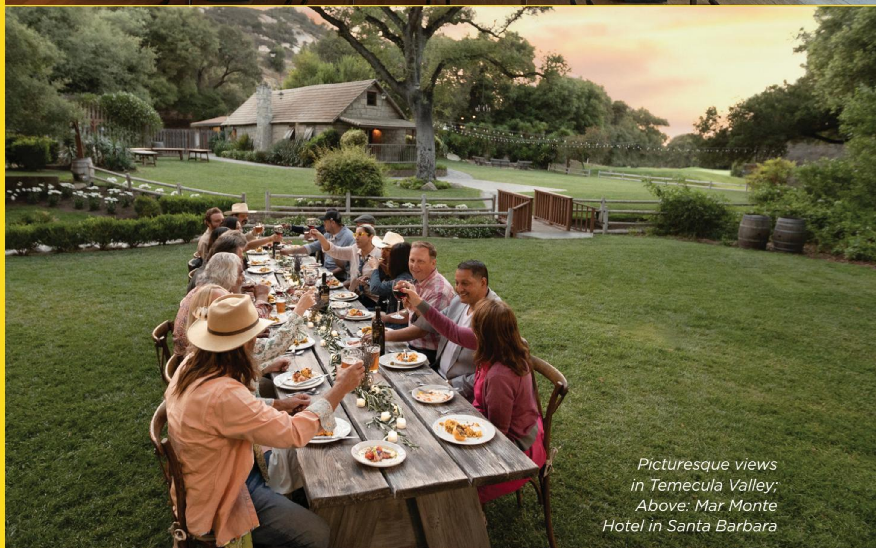
Picturesque views in Temecula Valley; Above: Mar Monte Hotel in Santa Barbara