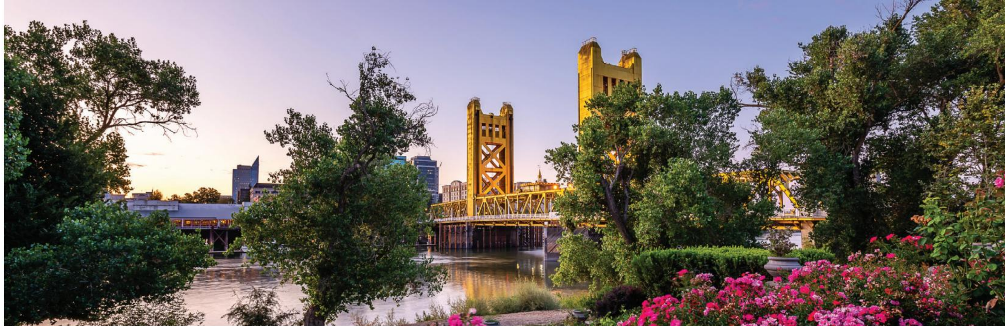
Left: The Tower Bridge spans the Sacramento River; Below: Dancing in the streets in Santa Ana