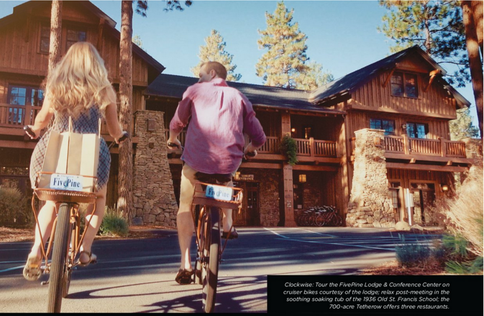
Clockwise: Tour the FivePine Lodge & Conference Center on cruiser bikes courtesy of the lodge; relax post-meeting in the soothing soaking tub of the 1936 Old St. Francis School; the 700-acre Tetherow offers three restaurants.

The 640-acre Pronghorn Resort just opened Huntington Lodge this past spring. Featuring 104 guest rooms and suites and a full-service spa, the lodge overlooks the 18th hole of one of the resort's two golf courses. It features a renovated Cascada signature restaurant with small plates served throughout the afternoon and evening. In addition, the resort's former restaurant, Chanterelle, has been transformed into flexible event and meeting space. Additional enhancements include a lodge bar and a new outdoor pool created for year-round use with a spacious deck and a central fireplace.