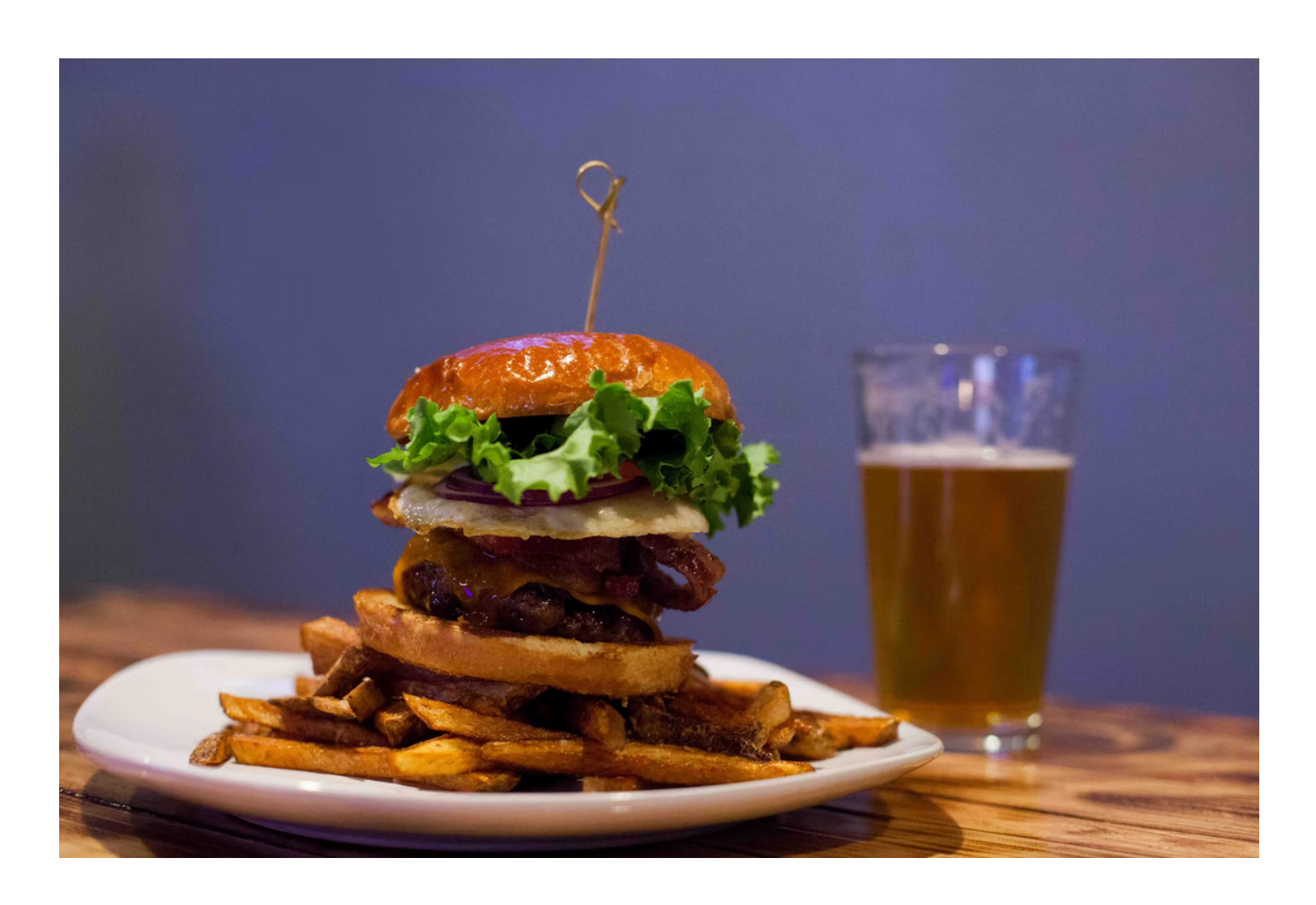
Pictured: Prohibition Gastropub Bootleg Burger

Before heading back to the hotel, cozy up to a romantic nightcap at any of these downtown <u>liquor dens</u>. With names like <u>Volstead Act</u>, <u>Purgatory</u>, Hogwash, and Cease & Desist--a good time is guaranteed for all.