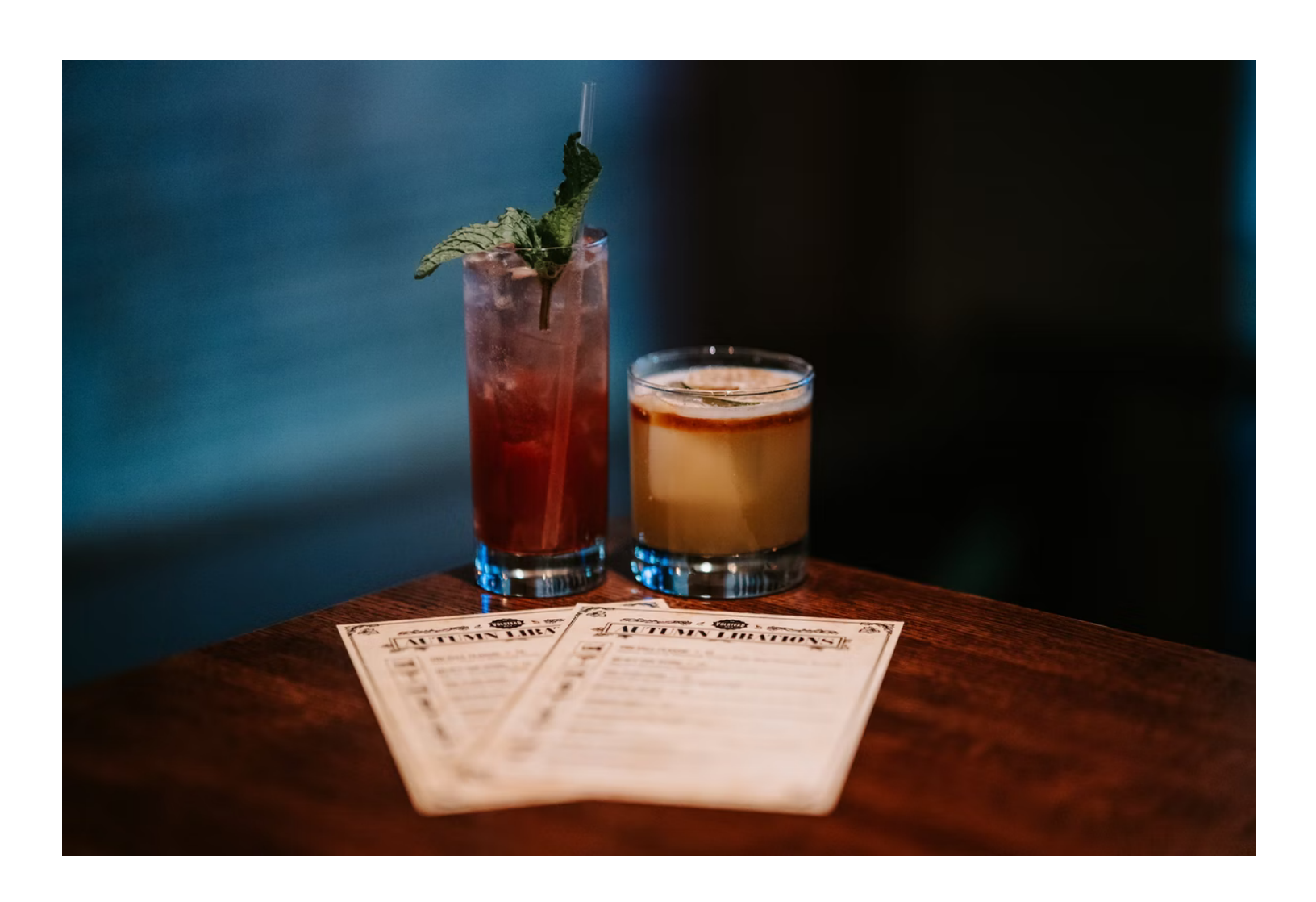
#7 PLAN A ROMANTIC DATE DAY

When dinnertime rolls around, the booming neighborhood of <u>Kendall Yards</u> has more treats for littles. Kids will love an ice cream break at The Scoop, or award-winning 'za at <u>Versalia Pizza</u>. By this point, the grownups will be exceedingly content to spend a few hours at kid-friendly <u>Maryhill Winery</u>, which doles out excellent wine, live music, and sunset views over the river.