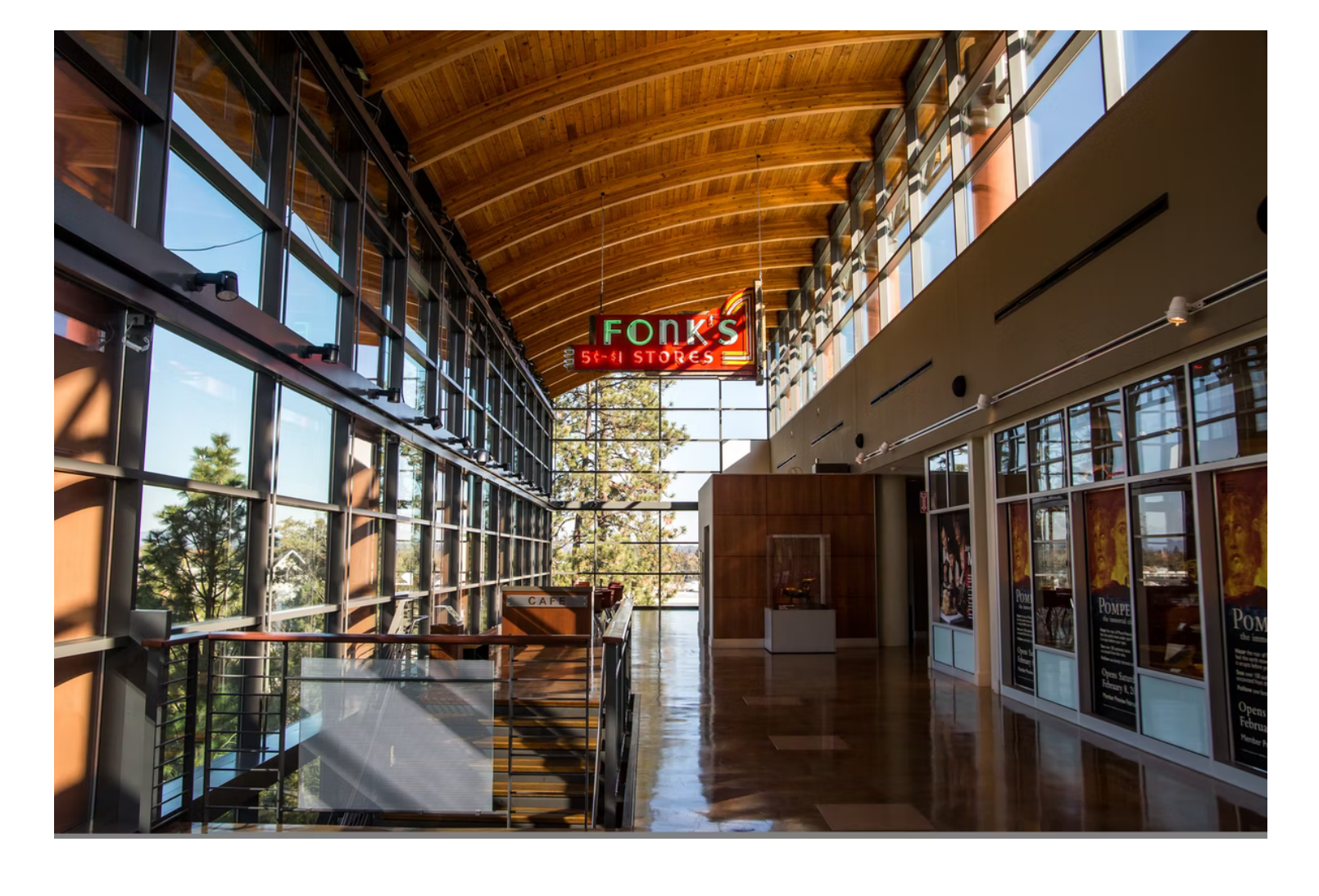
Pictured: Northwest Museum of Arts