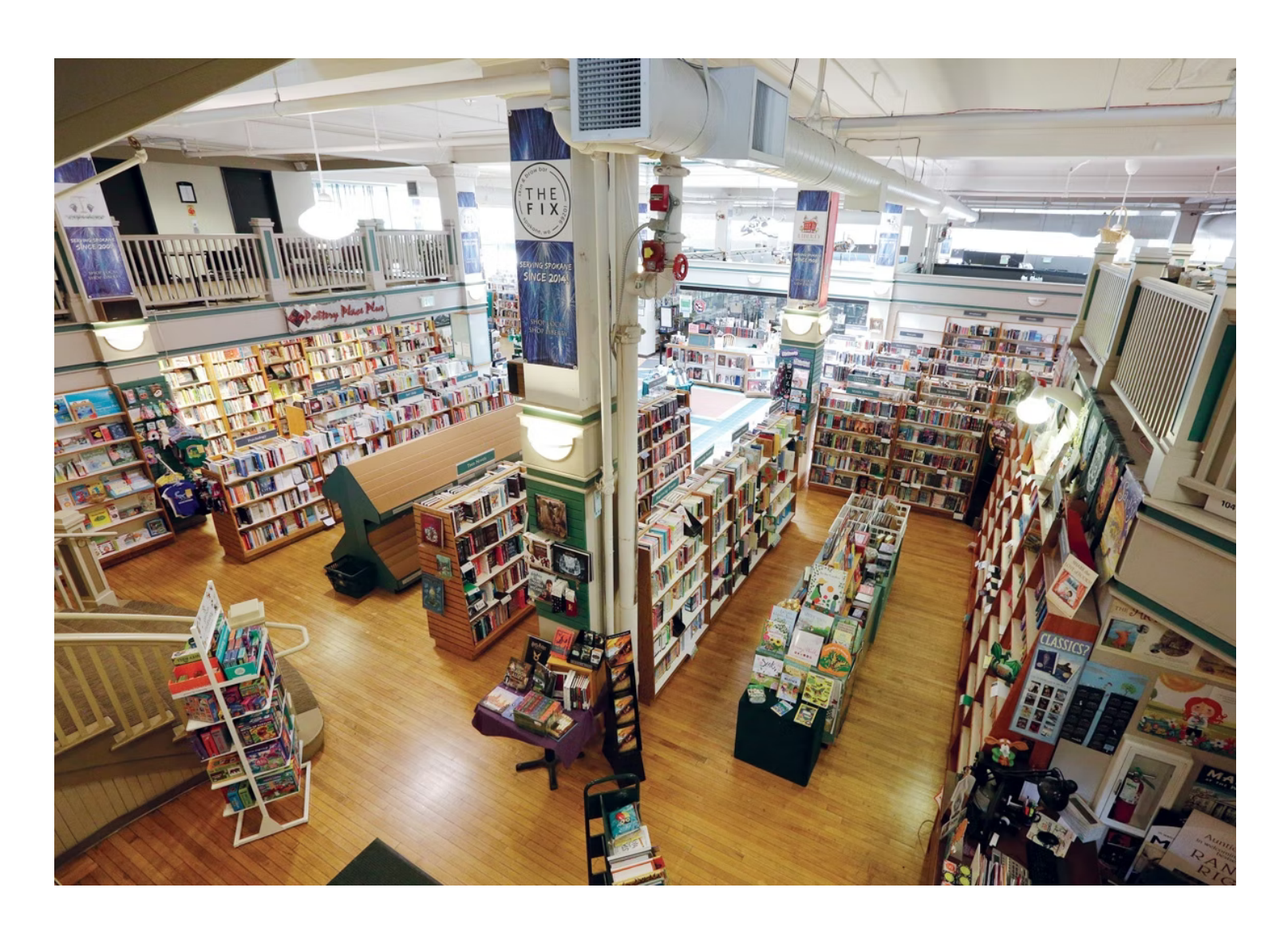
Pictured: Auntie's Bookstore

<u>Iron Goat</u> is a standout, with interesting snacks and great beer. Then off to <u>Brick West</u>, <u>River City</u>, <u>Whistle Punk</u>, <u>Lumberbeard</u>, <u>Black Label</u>—outside of Seattle there are more breweries packed into a smaller space here than anywhere else in the state.