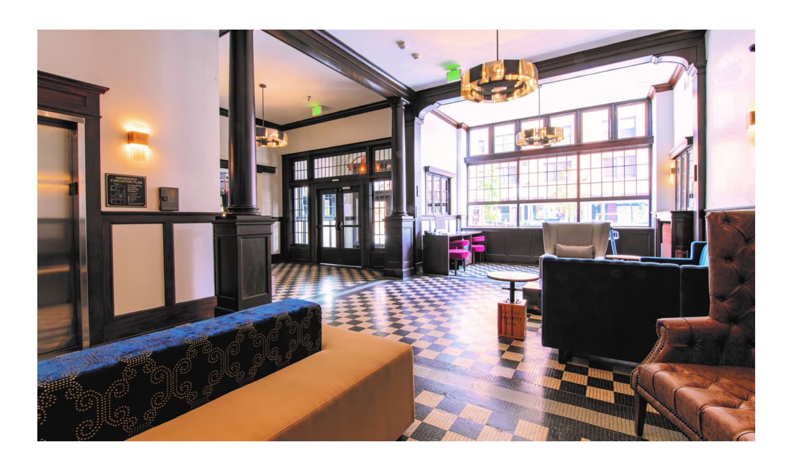
#11 SLUMBER IN STYLE

Spokane has a small but mighty list of distinctive shops for finding that perfect gift. Two sister stores -- inspired by To Kill a Mockingbird – are well worth the visit. Boo Radley's is a curio shop filled with unusual cards, t-shirts, and gifts for anyone with a sense of humor. Atticus Coffee & Gifts is its more sophisticated older sibling, with beautiful books and well-curated gifts for those on your gift list with impeccable taste for the finer things. Auntie's Bookstore is a beloved local indie purveyor of books, while next door the aptly named Uncle's Games stocks one of the best collections of board games in the state. Fringe and Fray has fab finds, Do It With Soul is resale clothing heaven, and Roses and Thread has bohemian chic for style mavens everywhere.